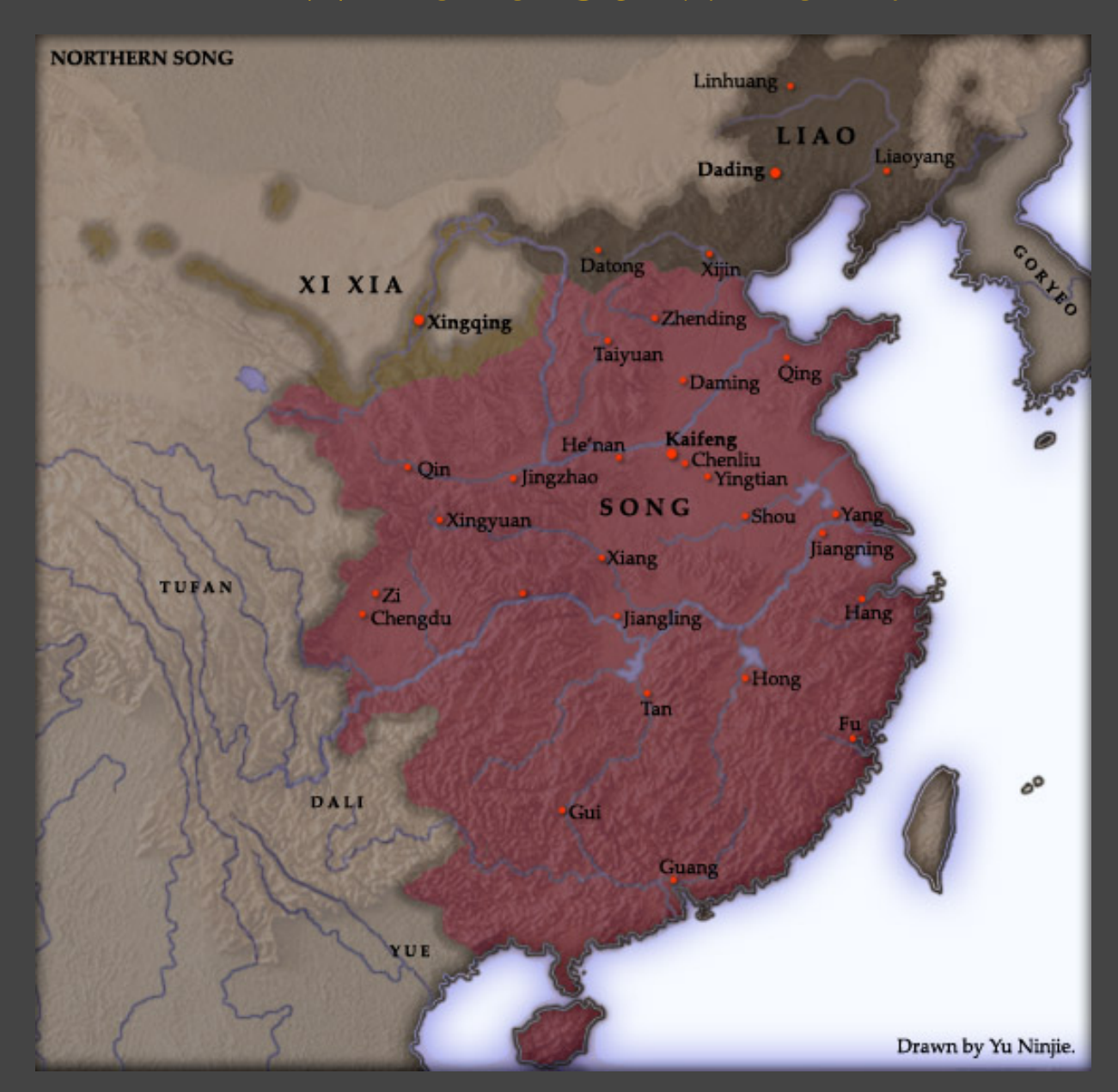
Sung (960-1126) - Ming (early 1900s) China