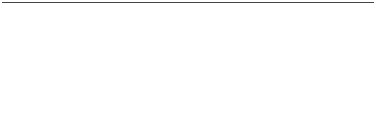
Figure 2. Example of a short caption, which should be centered.