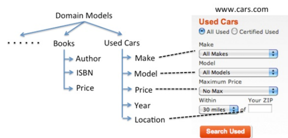
Figure 3 Mappings between domain models and form inputs can be used to automatically fill out HTML forms.

web-form is being matched to a model of user data that is stored in the browser. The user expects the browser to make a best-effort attempt at filling in personal details, which the user confirms before submitting the form for processing.