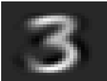
reconstructed with 10 bases