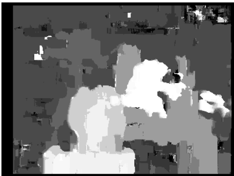
(e) Normalized correlation