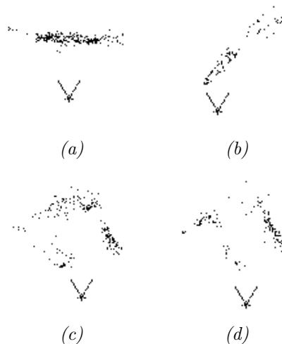
Figure 3: Sub-maps built at test positions. (a) Case M1. (b) Case M2. (c) Case M3. (d) Case M4.

Map alignment using RANSAC is then carried out between these sub-maps and the database map, we obtain the following results ( X_{cm} , Z_{cm} , \theta^\circ ):