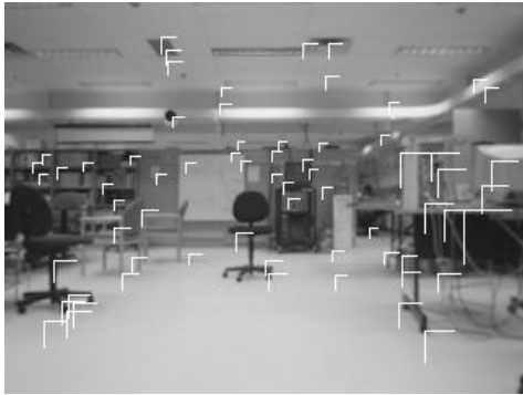
Figure 1: SIFT stereo matching result, where horizontal and vertical lines indicate the horizontal and vertical disparities respectively.