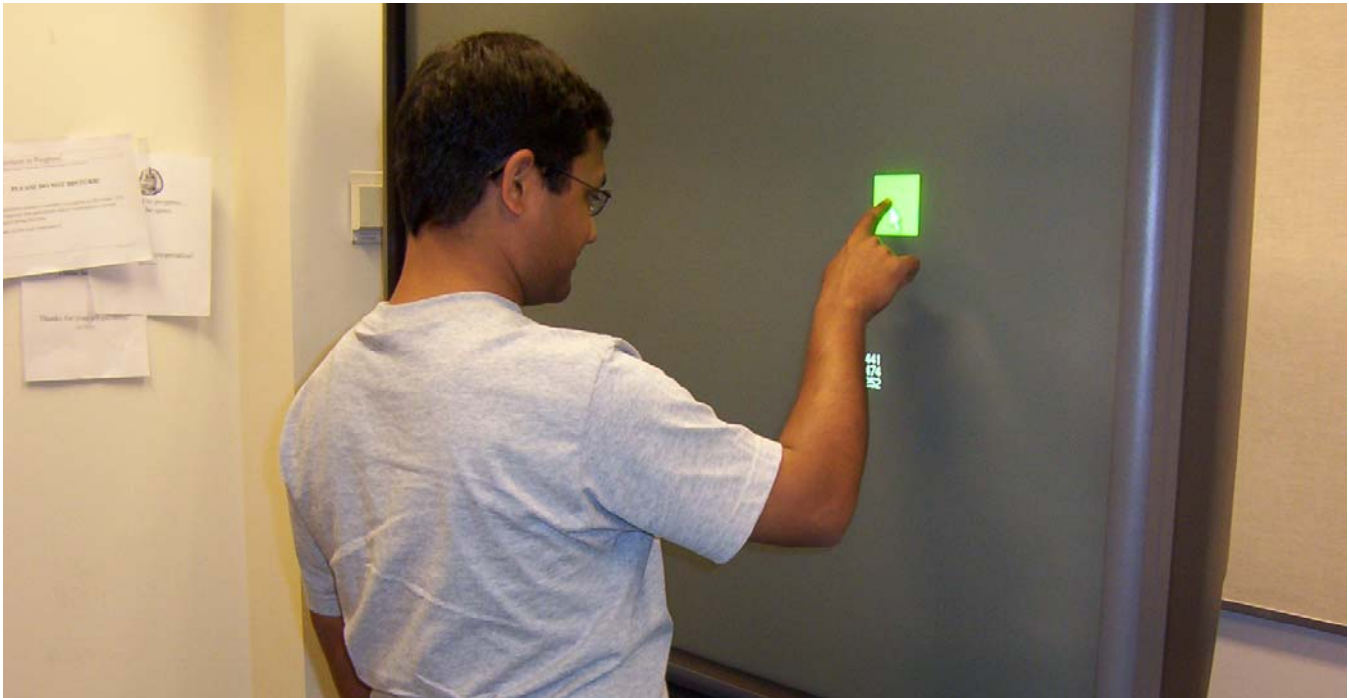
Figure 1. The SMART Board display used during the user study. Subjects stood upright during each block of trials. While fixating on a designated location on the screen, subjects either pointed directly at displayed items by touching them or indirectly by using an optical mouse (not shown). The designated location of fixation determined whether selected items appeared in the UVF or LVF.