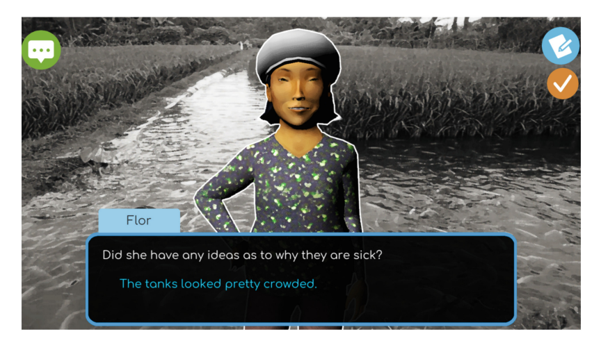
Fig. 1. CRYSTAL ISLAND: ECOJOURNEYS collaborative game-based learning environment

the first study. Cohen's kappa of 0.878 was achieved between the two raters on the chat messages from the second study, indicating almost perfect agreement. All three researchers involved in labeling the chat messages for both the studies labeled 20% of the first dataset in common and achieved Fleiss' kappa of 0.90, indicating very good agreement. A total of 2,259 out of 8,350 chat messages were labeled as out-of-domain in the combined dataset (M = 132.88, SD = 107.75 per group; M = 28.96, SD = 42.21 per student). The rubric used for labeling the chat dataset for both the studies is shown in Table 1 [21].