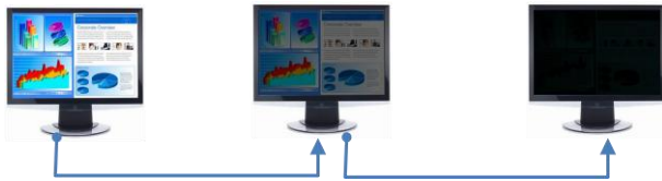
Figure 3. Gradual cancelable adaptation by dimming the screen before turning it off

strategy based on our experience in designing an interruption manager.