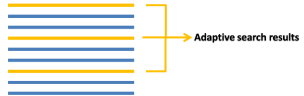
Figure 4. Mixing adaptive and non-adaptive search results and leveraging user feedback

Designing a gradual process for implementing an adaptation decision allows the user to cancel the wrong adaptation decision before becoming intrusive or harmful