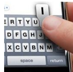
Figure 5. Multi-phase typing allows user to fine-tune his interaction

Researchers have proposed various techniques including tactile feedback [22], personalized alignment of keys [12], and pre-typing visual feedback [18], to deal with the usability issues of touch screen keyboards. In the latter technique, the interface is breaking the interaction into two phases to allow the user to fine-tune his input for achieving the desirable output. An adaptive touch-screen keyboard can use the user's web history, or context of the word to disambiguate user input (e.g. due to fat finger problems). In this technique, showing the outcome of the disambiguation algorithm is an epistemic action before the pragmatic action of actually adding the character to the text. The user interface is taking this action to get a subtle informative feedback (confirm, cancel, modify), to inform the decision about which character should be added to the text. A variation of this technique is used in apple iPhone and iPod touch keyboards [28] (figure 5).