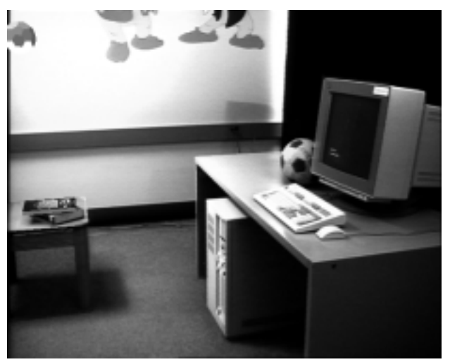
Figure 3. Final merged image.

Figure 4 shows the resulting images for the frame shown above.