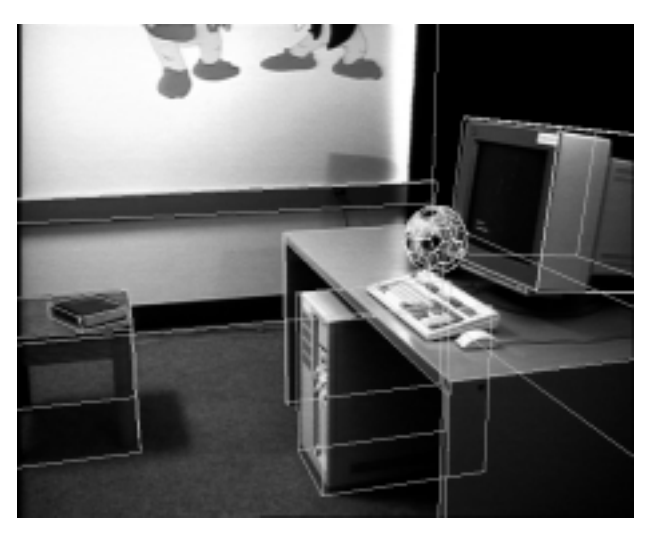
Figure 2. Original frame and overlaid wire model.

The first method consists in identifying fiduciary points on the image, and solving by least square a system of equations relating the known 3D world coordinates of these point to their measured 2D screen coordinates. The points on the image were identified and positioned manually. This results in a 4x4 matrix that transforms fairly accurately the 3D coordinates into 2D coordinates. Then, using the method described by [Gana84a] we compute the viewing parameters in terms of camera position, look-at vector, up vector, look-at point on the screen and screen scaling factors. In practice this turned out to be not accurate and/or consistent enough to be used through the animation. It still might turn out to be the best approach, but for this example we used instead an interactive matching method. An interactive program displays the wireframe of the model of the real objects, superposed to the RVI. A viewer then manipulates the viewing parameters until a satisfactory match is obtained. This is quite difficult though it is facilitated by keeping constrained as many parameters as possible. In practice we used only about 25 frames of the RVI to be matched, and derived the other viewing parameters by interpolation. It is clear that a method such as described in [Glei92a] would be much better for this purpose. Figure 2 shows an example of an RVI together with the matched wireframe image.