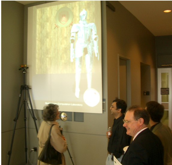
Figure 1: A demonstration of the Scarlet Knight during an all day public event.

The two motion sequences are overlapped, with the skeleton configurations being mixed at each overlapping frame - the terminating sequence fades out as the new sequence fades in.