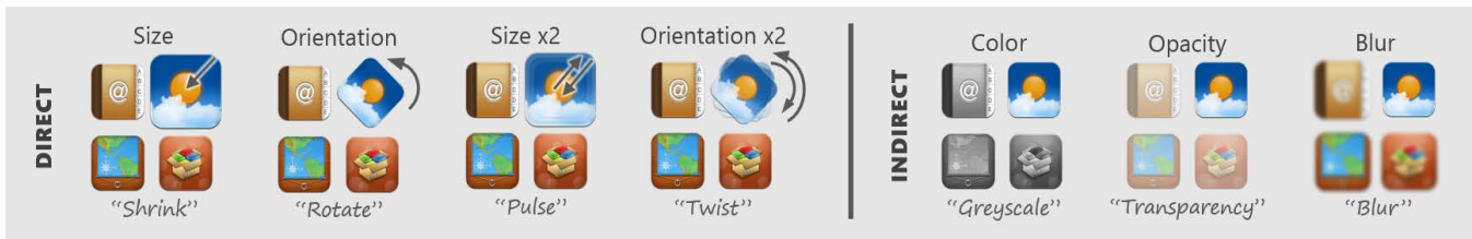
Figure 1: Direct and indirect ephemeral highlighting effects applied to the predicted weather icon (top right icon). The other three icons are non-predicted. Each effect is labelled with its corresponding preattentive visual property (top), and the name we used to describe it to participants (bottom, in quotes). The arrows indicate how the direct highlighted icons change over time.

ephemeral highlighting and which do not. The two most promising visual effects that emerged are Twist (icon rotates back and forth) and Pulse (icon grows and shrinks), as shown in Figure 1. Our experiment shows that these two effects significantly improve search performance over a control condition with no highlighting, independent of the number of pages of icons and the accuracy of the prediction algorithm used. Pulse is also subjectively preferred to Twist and the control condition.