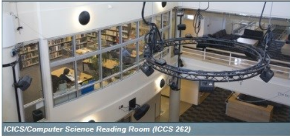
ICICS/Computer Science Reading Room (ICCS 262)

The ICICS/CS Reading Room provides dedicated, in-house information resources and assistance for the Department of Computer Science and the Institute for Computing, Information and Cognitive Systems :