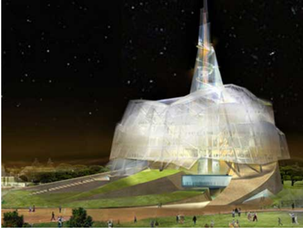
Canadian Museum of Human Rights