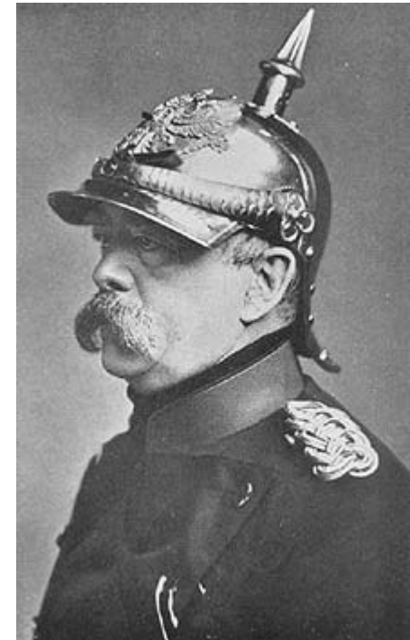
Otto von Bismarck in ceremonial Prussian pickelhaube