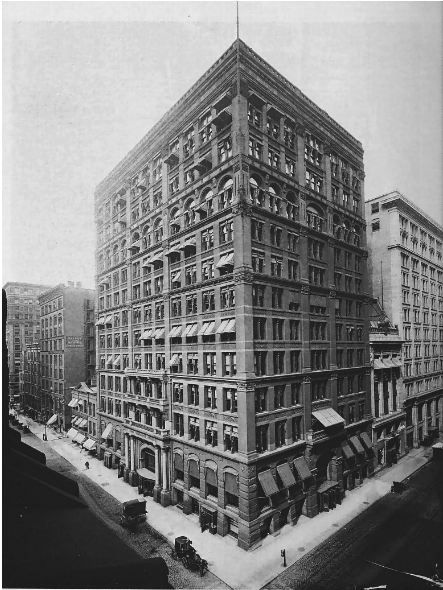
Home Insurance Building, northeast corner, 1890