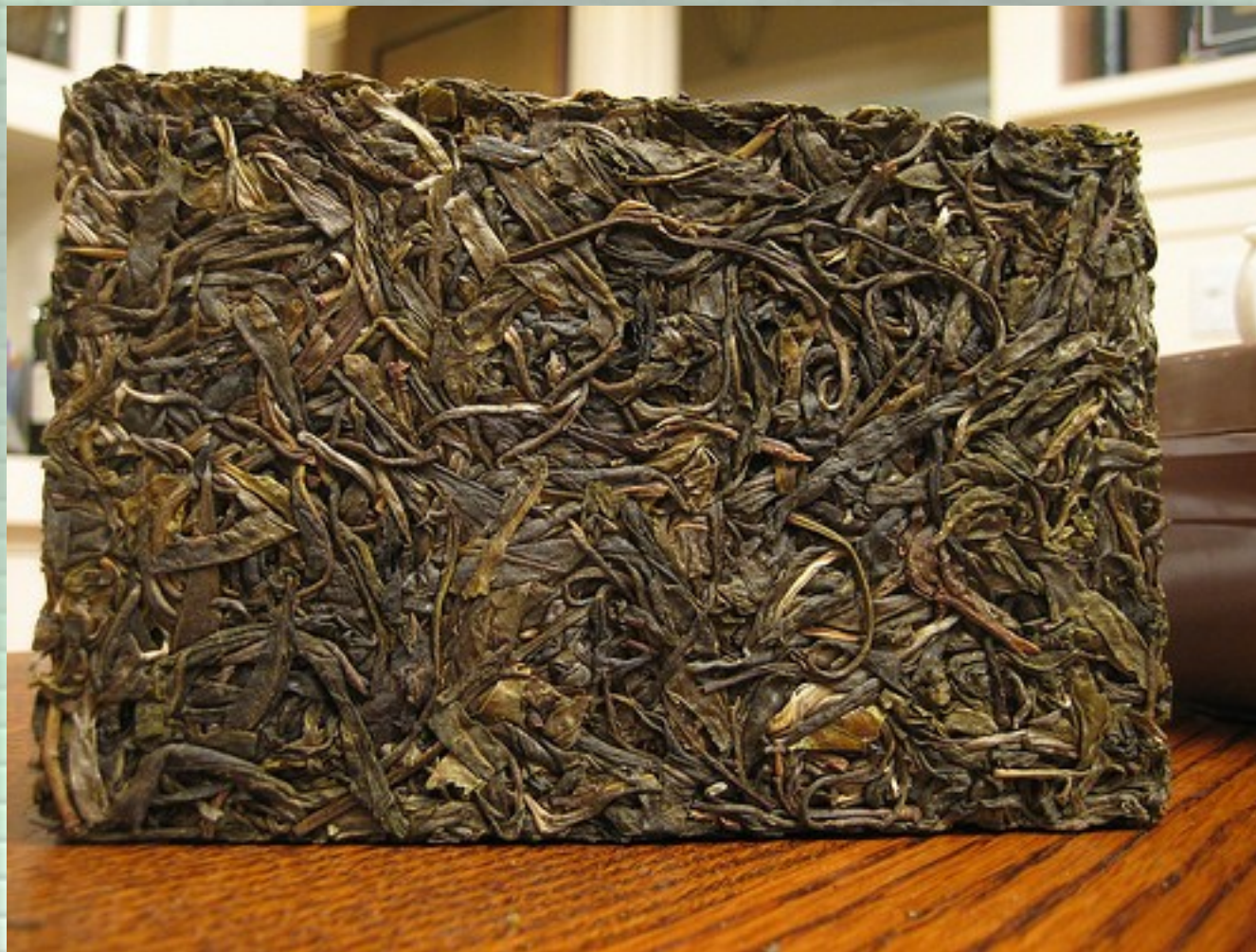
Pu-erh tea brick