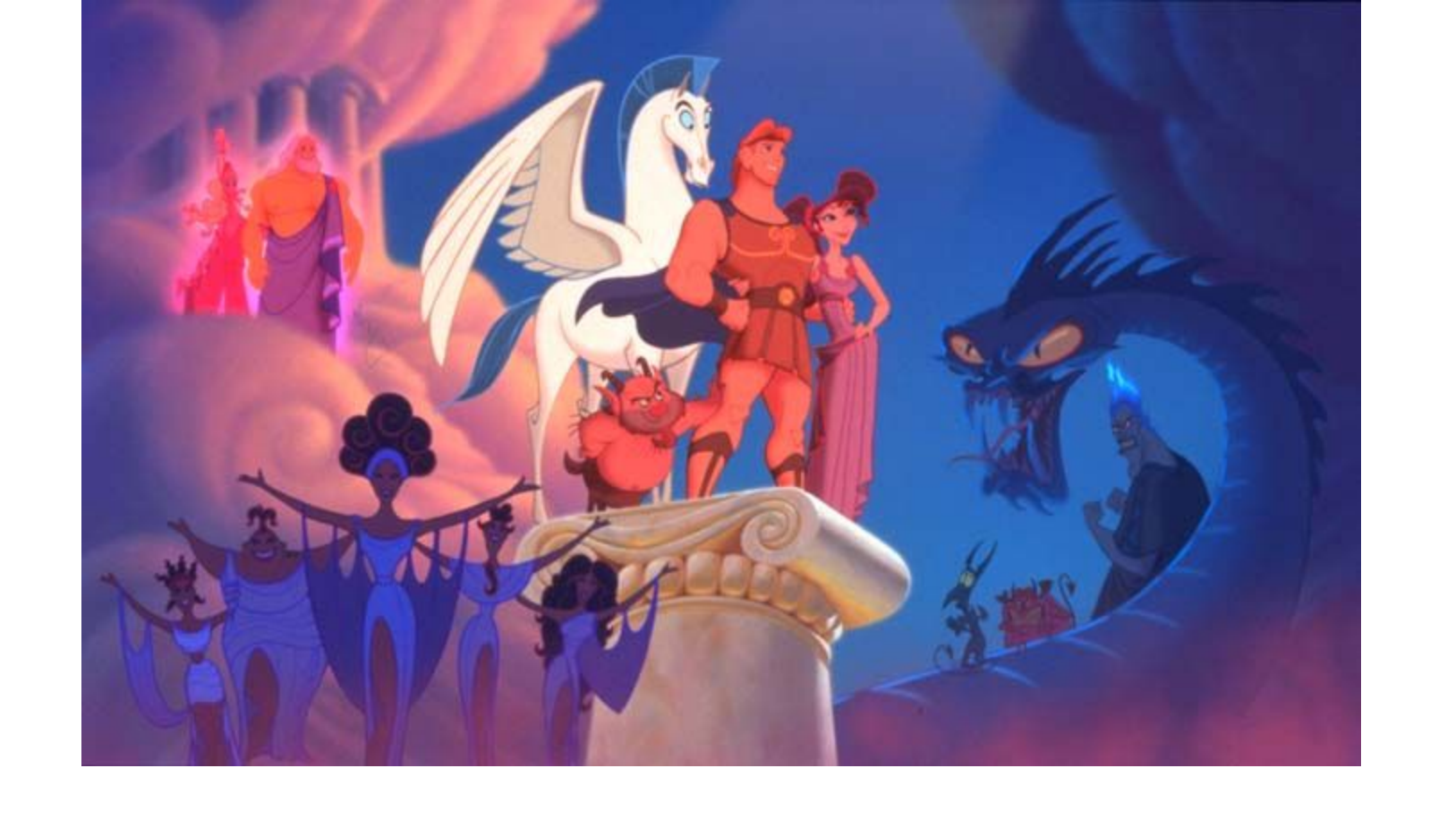
AS NICE AS THIS MOVIE IS, THIS WAS NOT THE STORY OF HERAKLES