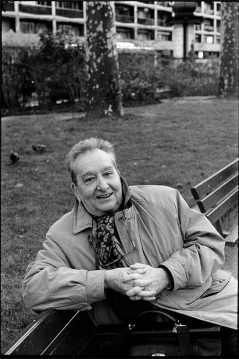
Raymond Boudon (1934-2013)