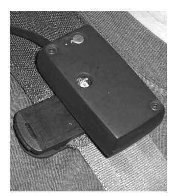
Figure 1: The MSB-microphone is on the upper right.

Equation 1 is the likelihood for a traditional ERGM where y represents the edges of the network, \phi are features of the network, \theta are weights to be learned, and Z is a normalizing term. Equation 2 is the likelihood for a model where the edges are hidden and interact indirectly via the observations x. Equation 3 is the likelihood for our model: evidence is only partially observed via d and a confidence function c weights values of x based on d. This is equivalent to 4, a multi-layer undirected graphical model where weights for fixed "virtual evidence features" are untrained and clamped to 1.