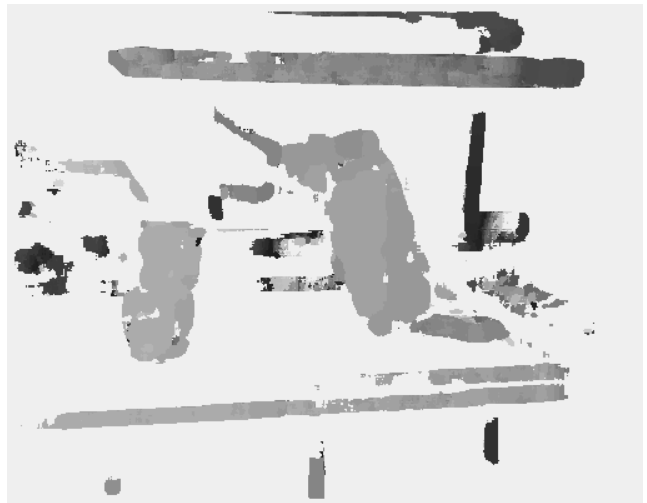
(b) Depth Map