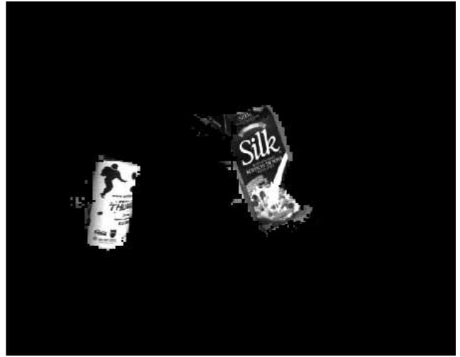
Figure 5: This figure shows the object snapshots of the cup and the milk box acquired through region voting.

The k threshold deals with situations where there is undersegmentation in the static individuation since it is difficult to set the static individuation parameters such there will be no undersegmentation. If the N parameter is set too high, the regions will be too small to have > n features in them. If two moving rigid objects are in the same region, there will be