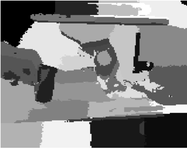
Figure 3: This is the resulting segmentation of the image and depth map in Figure 2 using normalized cuts based on both the pixel intensity and depth. Each region is represented by a constant gray level in this image.