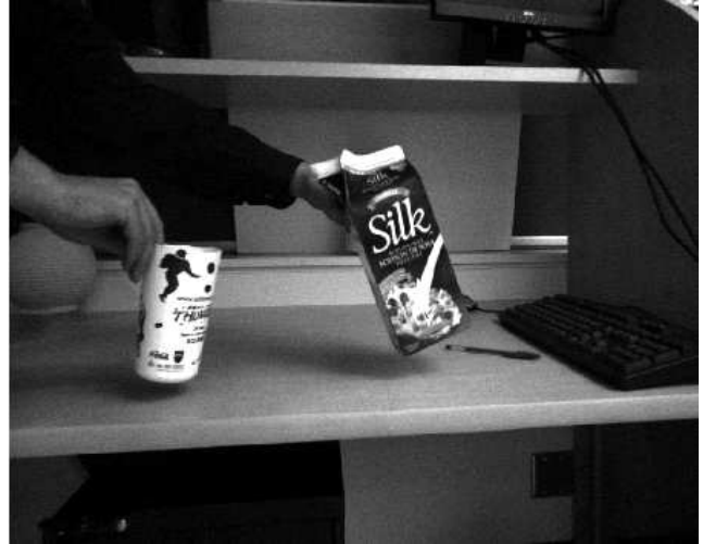
(a) Input Image

For our static segmentation we use normalized cuts based on pixel-level intensity and depth. Normalized cuts is a technique for segmenting a graph based on a dissimilarity function between nodes (Shi & Malik 2000). Image segmentation can be performed by treating the image as a graph where the nodes in the graph are the pixels with an edge between every pairs of node based on pixel dissimilarity. We employ a dissimilarity function in the normalized cuts based on both the input image I^t and depth map D^t . Fast algorithms exist for approximating the ideal normalized cut of a graph for a fixed number of segments N . The edge weight w_{ij} is the likelihood that the two pixels i and j correspond to the same object. In our system, w_{ij} is based on the difference between pixels i and j in intensity, depth and position in the 2D image plane. The function used to find w_{ij} in the our system is based on one presented in (Shi & Malik 2000), modified to include pixel depth information,