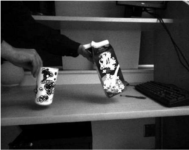
Figure 4: This image shows the position of two groups of rigidly moving image features from Figure 2. Rigidly moving features on the cup to the left are indicated with Os while rigidly moving features on the milk box to the right are indicated with Xs. Since the camera was static, there is no group of moving features associated with the background.

tion. We adopted this simple technique and found it effective in practice. The groups of rigidly moving features found through rigid body motion are used to determine which regions belong to the same object and should be aggregated to compensate for the oversegmentation. With region voting rigidly moving feature groups vote on whether a region contains part of the object that corresponds to that group. The number of votes is the number of features from a group within that region. We also allow the background feature group to vote on whether a region corresponds to the background as an error detection and correction mechanism.