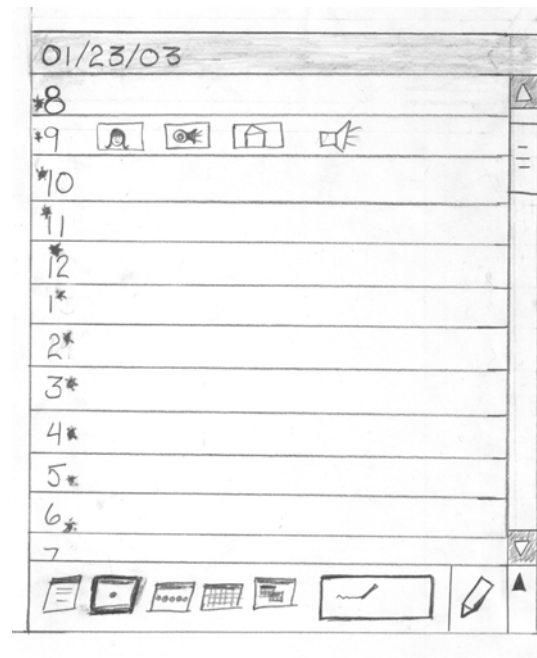
Figure 1: low-fidelity paper prototype of the electronic daily planner application that uses images and sound to mark a scheduled event.

The goal of the interactive electronic recipe book is to address the difficulty that many aphasic individuals have in processing large chunks of text. For these individuals, text needs to be broken down into short phrases with substantial white space surrounding each phrase. AB particularly enjoyed cooking and had the motor and cognitive skills to continue to do so. The problem was that she could not read traditional recipes that included a long list of ingredients followed by two or three paragraphs of dense text describing the process of combining the ingredients. AB thought that if the cooking process were broken down into its elementary steps, with each step being described in simple language and identifying the requisite ingredients through pictographs, she would be able to follow a recipe once again. Figure 3 shows our first medium-fidelity prototype of the interactive electronic recipe book.