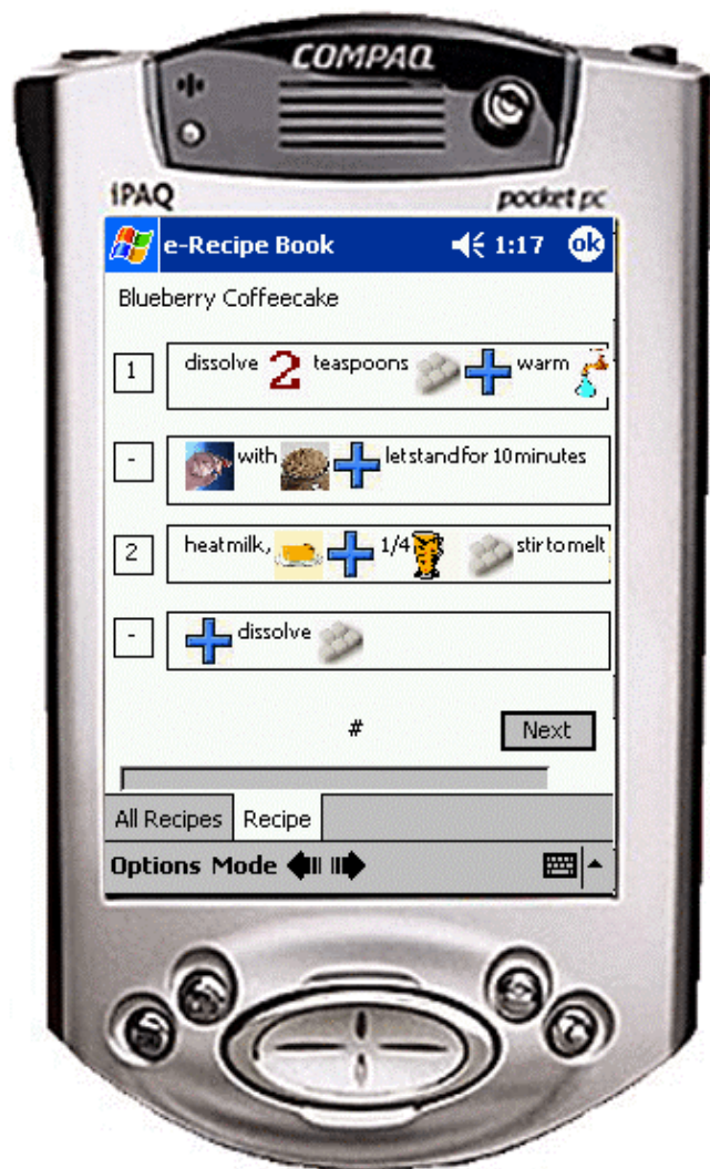
Figure 3: medium-fidelity prototype of the electronic recipe book.

In order to reduce the reliance on the user’s ability to communicate precisely, we plan to concentrate on medium-fidelity prototypes. A medium-fidelity prototype consists of a computerized implementation of the application with functionality limited to just enough core features that a few example scenarios can be evaluated. With a medium-fidelity