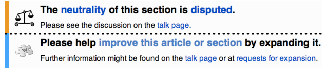
Figure 1. Templates come in many forms to serve different purposes. The two non-parameterized templates above, defined in the template namespace, are invoked using the {{POV-section}} and {{Expand}} snippets, respectively.

Pages and namespaces. Wikipedia pages are organized into namespaces . The main namespace contains the encyclopedic articles; the user namespace contains pages for registered users; the category namespace allows the construction of categories; the template namespace allows the authoring of parameterizable structures that can be instantiated on other pages; and the wikipedia namespace contains a set of policy and guideline pages, task- or topically-organized