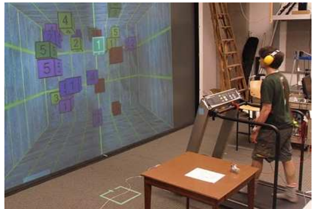
Figure 1: Experiment setup. Subject responds to vibrations while walking on the treadmill and doing the visual task.

During half of the trials in each condition, participants performed a workload task targeting vision, memory, and attention as shown in Figure 1. A screen four meters wide and three meters high displayed twenty-five blocks bouncing slowly around a three-dimensional room; one block was highlighted and participants counted the times the highlighted block hit any of the walls. The task was chosen for its controllable continuous workload typical of normal pedestrian activity, with distraction adjusted so that participants would not fall off the treadmill. Participants reported their collision count at the end of each workload condition.