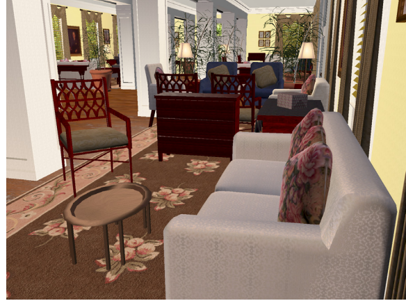
Figure 2: Hardware rendered result using our method. The couch, tan chair, blue chairs, table cloth, leaves, brass table, and gift wrap have measured SBRDFs. The cherry wood and floor wood are painted SBRDFs. Surfaces have 1 or 2 lobes per texel. Three hardware lights are used. Average frame rate for this scene is 18 fps.

The first of each pair of passes is rendered into a p-buffer – a portion of video card memory that can store an off-screen image. P-buffers may be rendered to like a screen window