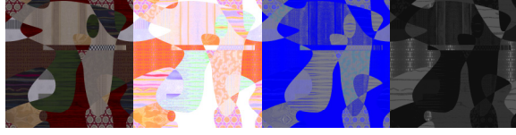
Figure 1: Texture maps used in Figure 5(d): diffuse albedo ( \rho_d ), lobe albedo ( \rho_s ), lobe shape ( C ), and lobe exponent ( n ). Lobe shape maps -1..1 to 0..1. The lobe exponent is stored in the alpha channel of the lobe shape texture.

The Lafortune representation is evaluated in local surface coordinates. The X and Y axes are the principal directions of anisotropy and Z is the normal. The matrix C is defined as C_x = -1 , C_y = -1 , C_z = 1 to cause \omega_i to reflect about the normal, yielding a standard Phong lobe. But each lobe is significantly more general than a Phong lobe: the C coefficients may also take on other values to shear the specular lobe in ways that represent real surface scattering behavior but still enforce reciprocity and conservation of energy. The lobe's peak will be in the direction C \cdot \omega_i . For isotropic BRDFs, C_x = C_y . For off-specular reflection, |C_z| < |C_x| , pulling the lobe toward the tangent plane. For retroreflection, C_x > 0 and C_y > 0 . When C_x and C_y have opposite sign, a lobe will forward scatter when parallel to the principal direction of anisotropy, but back scatter when perpendicular to it, as arises with parallel cylinder microgeometries (Westin, Arvo et al. 1992). The Lafortune representation's great flexibility to aim and scale each scattering lobe is key in using few lobes to approximate BRDFs. This property also enables our glossy environment mapping technique.