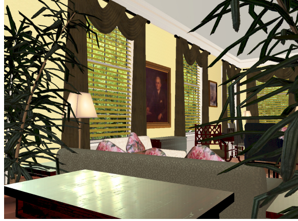
Figure 3: Software rendering simulating our prefiltered environment map technique. Specular exponents range from 1 to 5 for the couch, 5 to 15 for the grain of the wood, and 75 to 150 for the wood foreground. The wood is increasingly reflective at grazing angles.

Several representation alternatives arise for the S(\omega_p, n) map. The possibilities are constrained by the graphics hardware's small choice of texture representations. One possibility is to represent S in a single cube map, with the