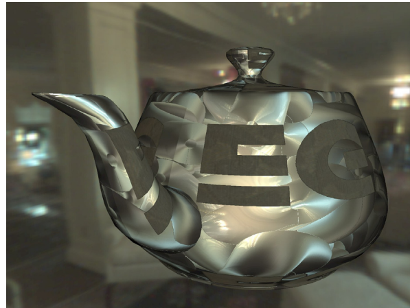
Figure 6: Anisotropic brushed metal teapot with spatially varying direction of anisotropy, with white fabric lettering. One SBRDF with three lobes is used for the entire surface. Illumination comes from the prefiltered high dynamic range lobby environment map.