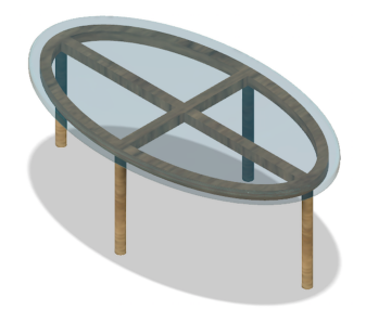
Figure 1: Example model used in the main study task.

tests to check the models' levels of difficulty. Based on our pilot tests, we expected that newcomers would make progress, but would also feel the need to find help when stuck.