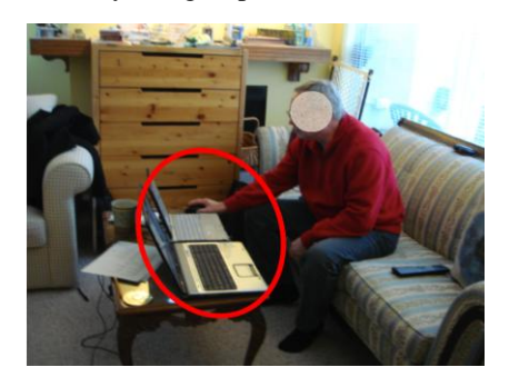
Figure 2. C-TOC running on a notebook computer placed on the right of the participant's computer; participant use the two computers as "one big computer".

Interview and observation data are analyzed using open coding to identify and group common themes.