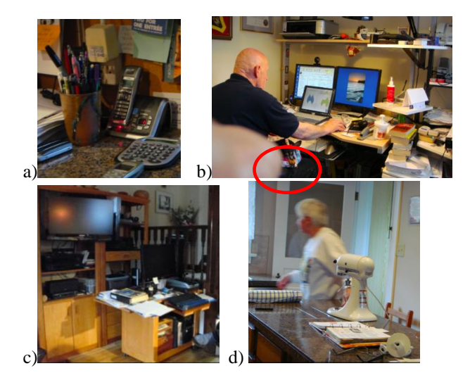
Figure 3. Interruptions in home environment: a) phone calls, b) pets needing attention (puppy circled), c) TV and radio, d) noises from kitchen and general ambient noise