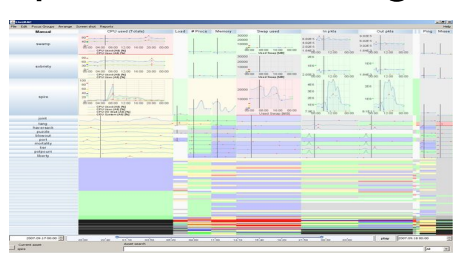
LiveRAC (CHI 05)