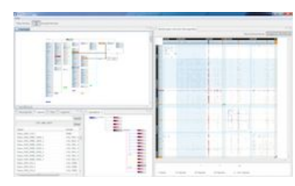
RelEx (InfoVis 12)