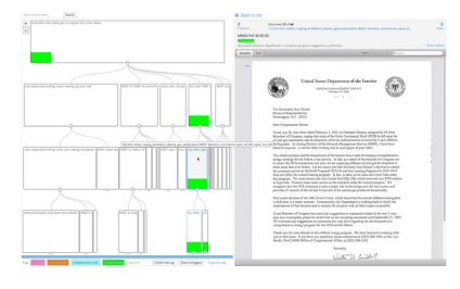
Overview (InfoVis 14)

recent best practice: start writing earlier, in parallel