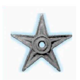
For countless hours of editing Wikipedia and welcoming new users. Griz 03:26, 18 January 2006 (UTC)

A random sample of 200 barnstars was analyzed using open coding to develop an initial codebook (Strauss and Corbin 1990). The codebook has seven broad dimensions of work. Each of these seven dimensions is comprised of from 4 to 10 different work type instances. For example, one of the dimensions of work commonly acknowledged by both Wikipedians and prior research is vandal fighting – which belongs to a dimension we call "Border Patrol." In this dimension we found eight different types of work activity, including vandal fighting on specific page types (article pages, user pages, administrative pages etc.), article deletion, spam detection and removal, and identifying copyright violations. We then applied the codebook to a second random sample of 200 barnstars and further refined the codebook.